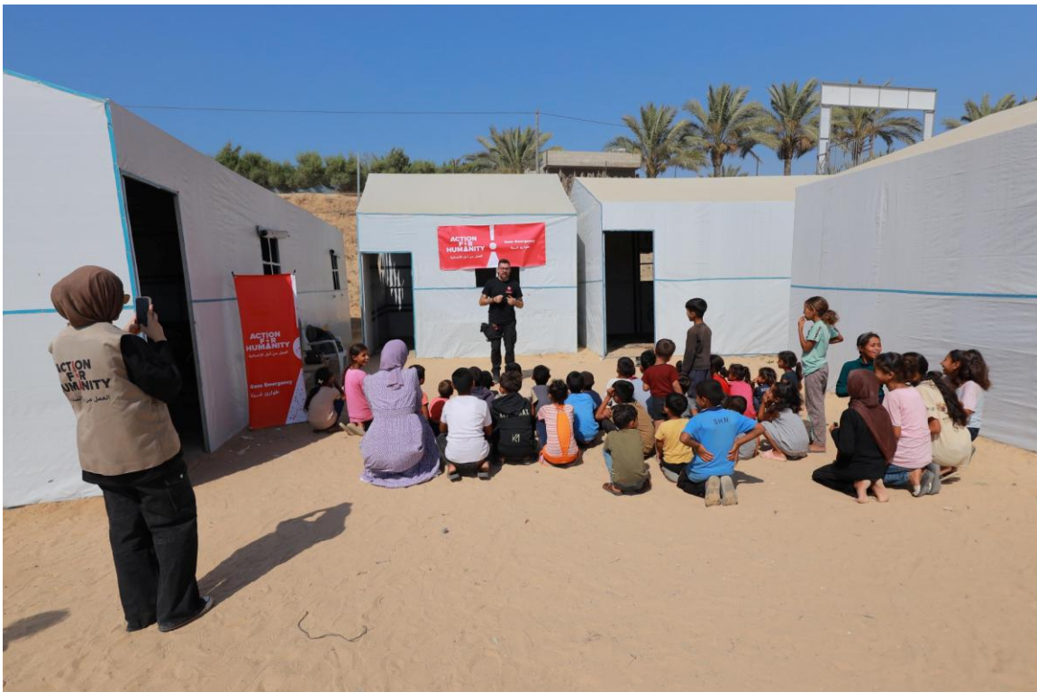
Photo: MHPSS in Hope Camp, Gaza