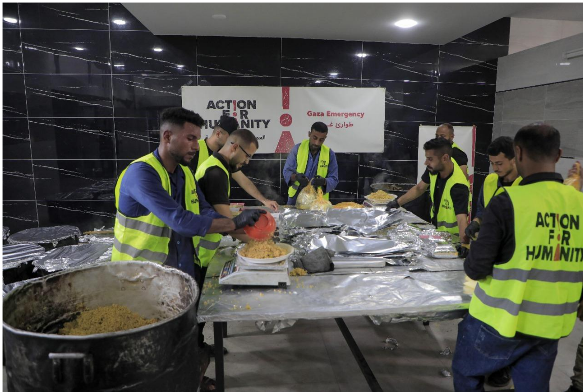
Photo: Hot Meal Preparation