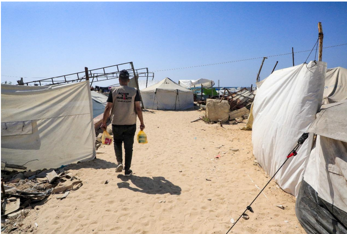
Photo: Hot Meal Distribution