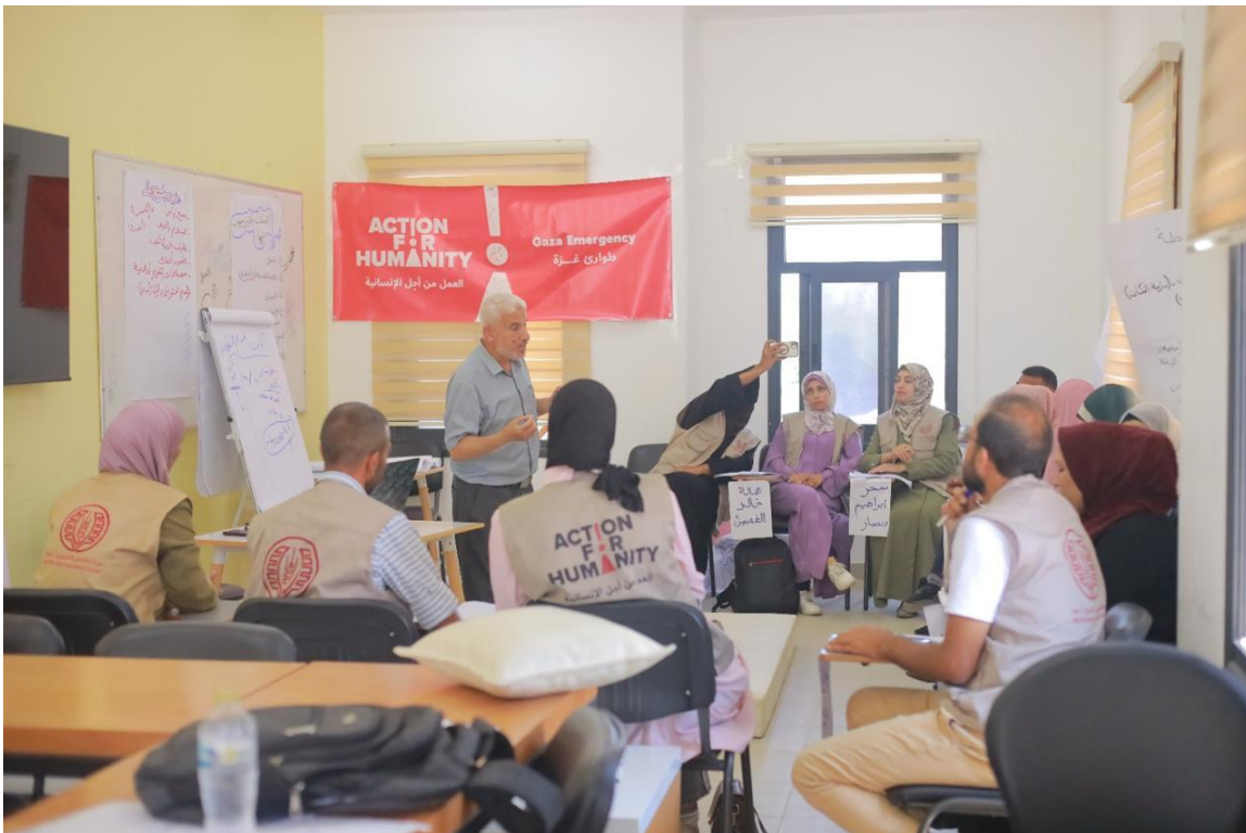
Photo: Session with Educators